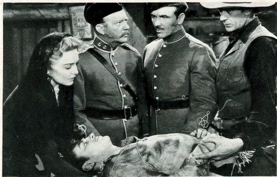
Madeleine Carroll, Preston Foster and Gary Cooper in NORTH-WEST MOUNTED POLICE (Paramount)