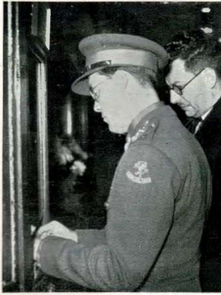
Prince Bernhard of the Netherlands buying seats for the premiere of NORTH-WEST MOUNTED POLICE at the Carlton