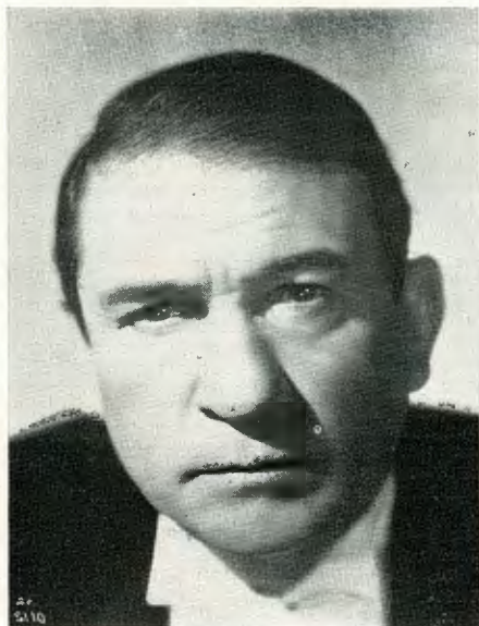
Victor McLaglen, the star of Universal's DIAMOND FRONTIER (G.F.D.)

OFFERINGS TO BE SCREENED BETWEEN THURS., NOV. 28 AND WED., DEC. 4