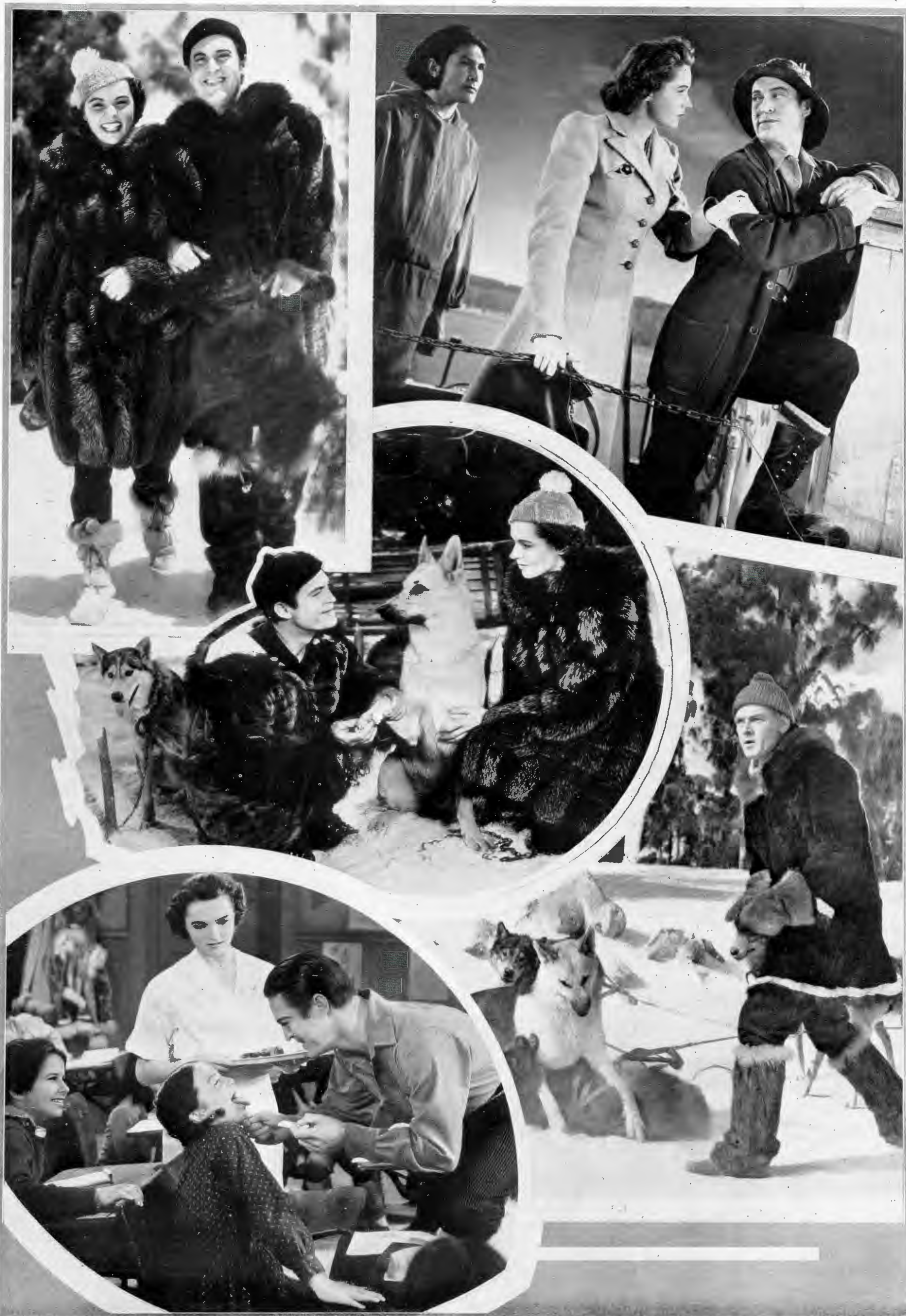
In Republic's GIRL FROM GOD'S COUNTRY, a tense drama of a wild, ice-bound country, Chester Morris plays the part of a physician whom fate and other circumstances have banished to a Northern outpost of civilisation. Jane Wyatt is a gallant nurse who braves all hardships for the man she loves. Charles Bickford also has important role in the picture, which British Lion will Trade show on Tuesday, December 3, at 11 a.m., at the G.-B. Private Theatre