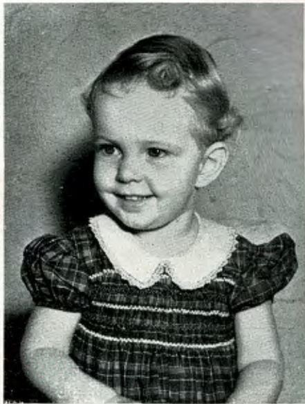
"Sandy," in SANDY IS A LADY, Trade shown on Wednesday by General Films