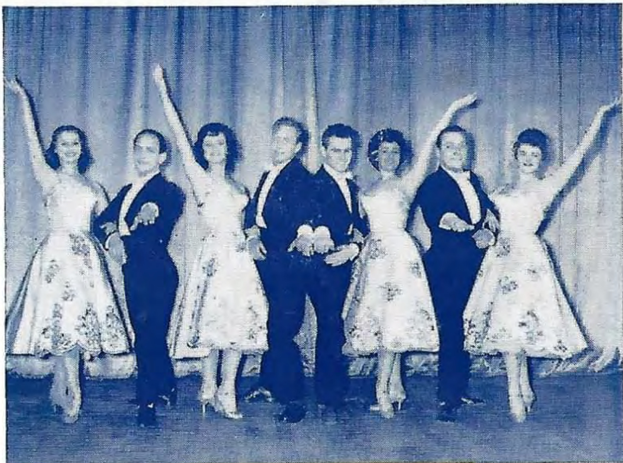
★ GEORGE MITCHELL SINGERS