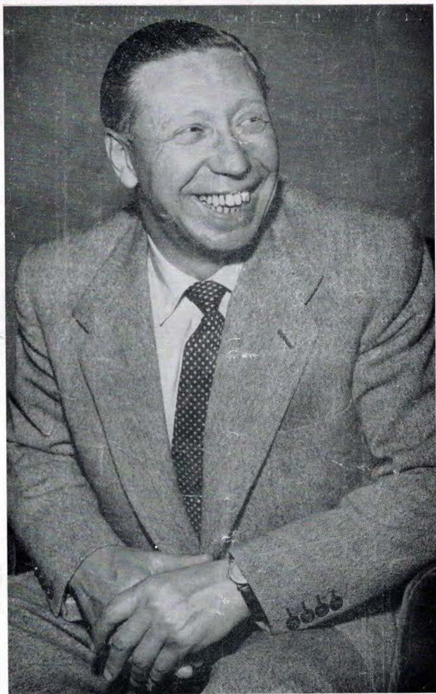
“The George Formby Show”