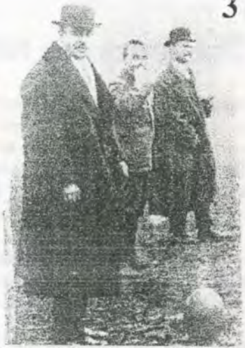
George kicks off at the Wigan v Hunslet rugby match Dec 7 1912.

George Formby Senior tells more of his own story:- Bad luck followed, but my wife, who, to this day, works with me, did her best to cheer me up, and incidentally, earned something from her dressmaking.