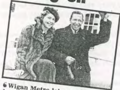
Wigan Metro leisure services department has not forgotten George Formby and the spirit of music hall which he represented. ☉