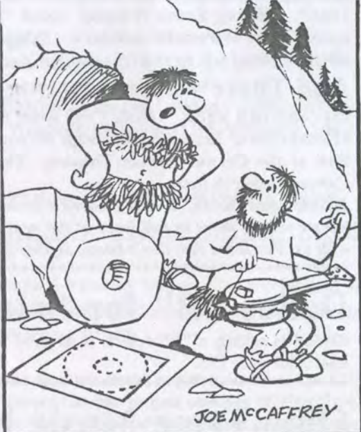
Is that another one of your daft ideas?

Thanks for your report Brian. I don't know if you sensed it but there is something very awesome back