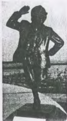
This is not an "Oscar" but an "Eric"

The North West Area Final is being held at the Dome Theatre Morecambe on Wednesday the 7th June at 2pm and the ticket cost is only £2.50, which is a bargain. Tel 01524 582803 for tickets. The winners of the area finals will receive not a "OSCAR" but an "ERIC" which is a small statuette of Morecambe's own Eric Morecambe. The act will then go on to the all England finals to be held at the Southport Apollo Theatre 26th July, Tel 01704 500036 for tickets.