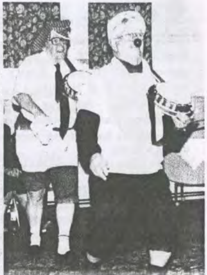
Two fine figures of men marching to "The Soldiers Dream" or was it "Th - Sol - i - rs Dr - am?"

DISASTER - All the equipment set up - Mini Disc, Tape Player, Amp, Mikes, - perfect and we are all ready for the "Off" We pushed the button for the backing disc and all sounded perfect for exactly 10 seconds and then, - DISASTER!!! - The amp cut out and the backing music and mikes were cut off. At the same time a light came on the hall telling the crowd that there was no sound. I didn't quite see the logic in that because the audience already knew that the sound has been cut off.