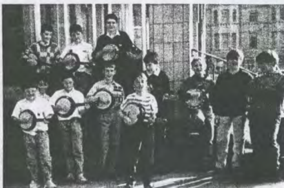
Just a few of the merry band of young players we had in the 90s. Where are they now?

about the many youngsters we had in the society from 1991 when the Warrington Exhibition attracted them like flies round a honey pot. We had loads of em and they were all learning to play the uke far better than any of the grown-ups. Each month I'd like to do a feature on the kids - as they were then and what they are doing today.