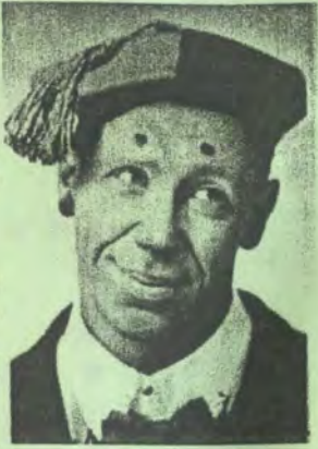
George is looking very sad because

told by a council official that they don't want a statue of