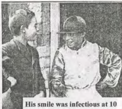
His smile was infectious at 10

We are under the opinion that you should race under the name of Mr George Formby as before. Yours Faithfully, Weatherby & Sons