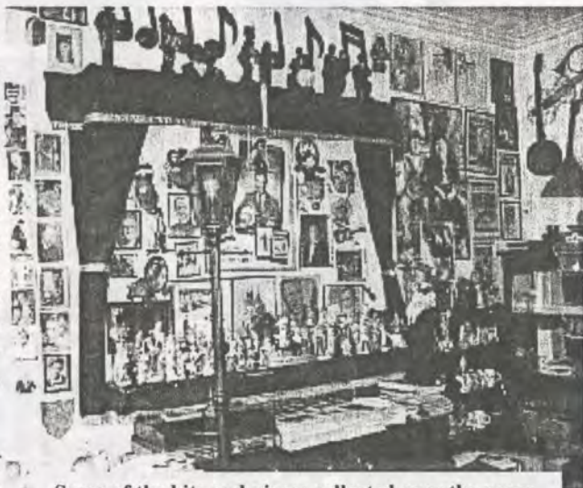
Some of the bits and pieces collected over the years

Isn't it amazing how things happen at the wrong time. For the past weeks I have been very busy transferring all my GF and Music Hall memorabilia into my office. This has been quite a mammoth task, climbing up and down the steps hundreds of times making sure that every square inch of wall space is completely filled.