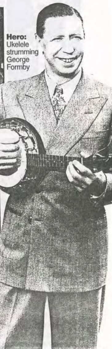
Hero: Ukelele strumming George Formby

"I started playing Something on my ukelele but instead of going mad, he shouted 'Keep going, keep going', grabbed his ukelele and played along.