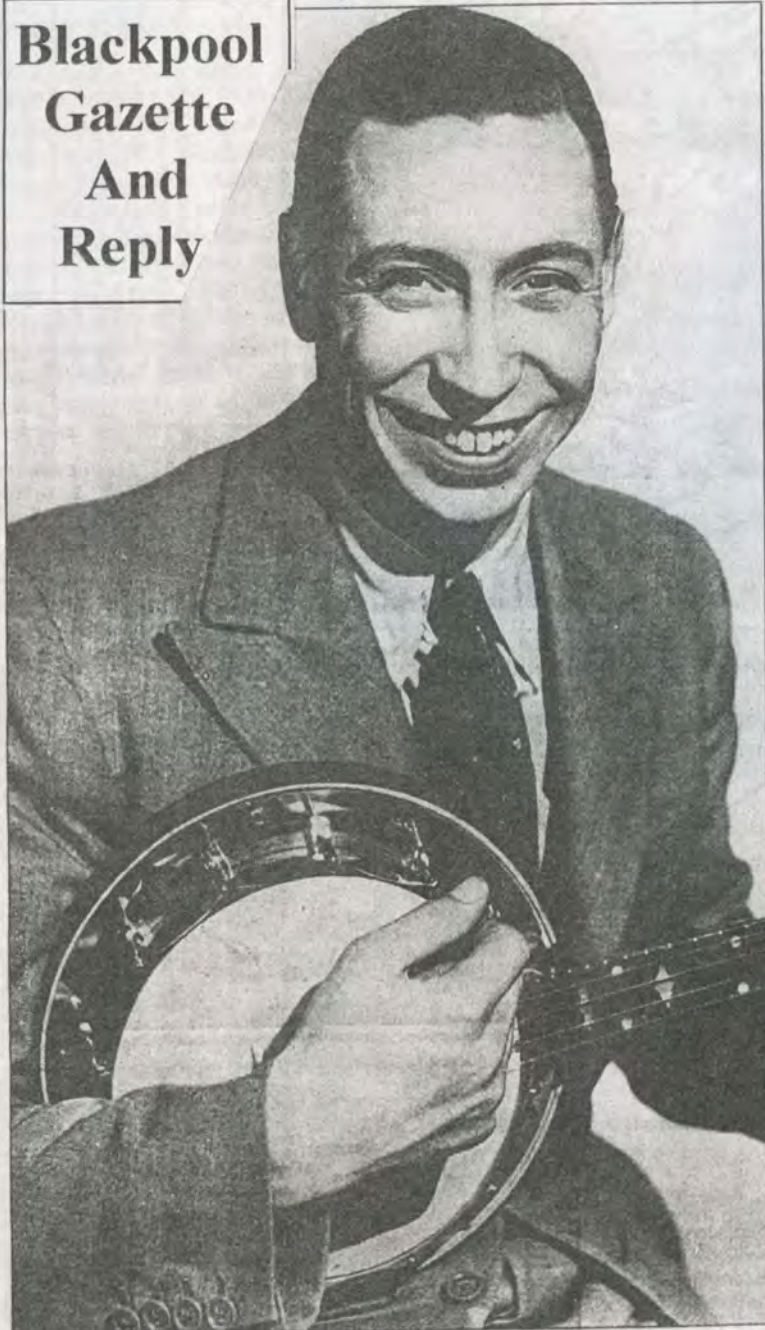
BLACKPOOL LEGEND: Our correspondent would like to see the resort pay tribute to George Formby