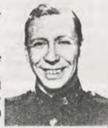
Come on George

Due to mindless and selfish interference by a well known, so called Formby Fan, the council destroyed all the Formby family display boards, posters, photos, cartoons etc. costing anything up to £20,000 and I've not forgiven them for that. And never will!