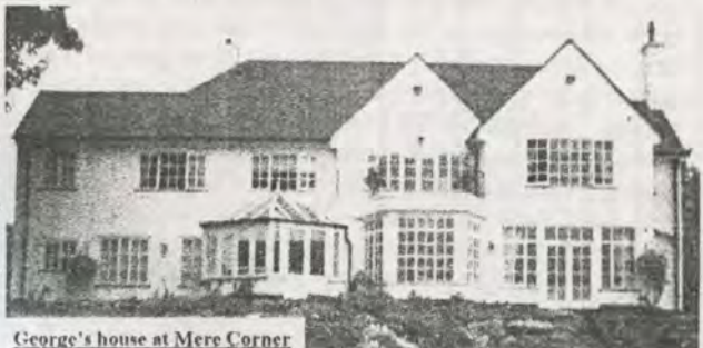
George's house at Mere Corner