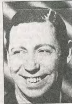
GEORGE FORMBY: Concert tributes

CREWE NOTICE —May 28th—It has been decided that our uke programme for this night only will be confined to Formby numbers. We will see how many different songs we can pack into the evening's entertainment. So "Get Cracking" preparing for this show. This does not affect our vocalists or speciality supporting acts. Special guest artistes are invited so it is going to be a great show.