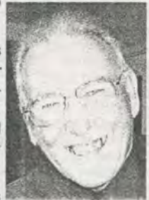
Is this the man you are looking for?