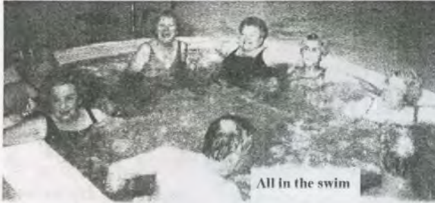
All in the swim