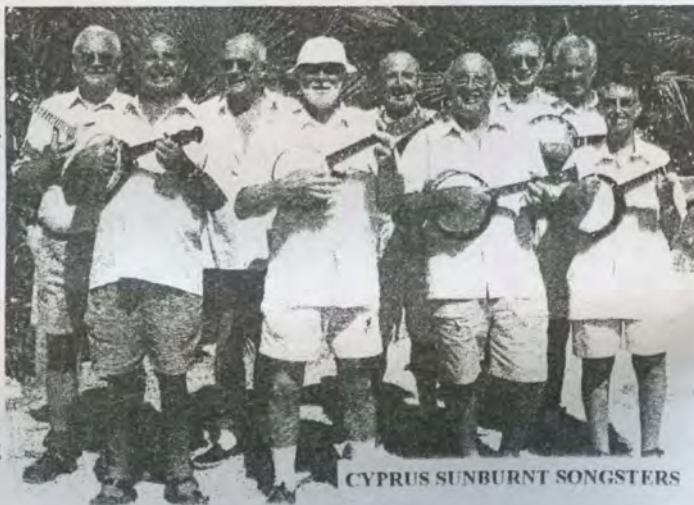
CYPRUS SUNBURNT SONGSTERS

Well, what a happy bunch of troubadours they look as they strut their stuff in sunny Cyprus. We look forward to meeting em all.